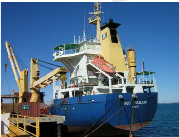
BBC Sealand in the harbour of Dampier/ Australia