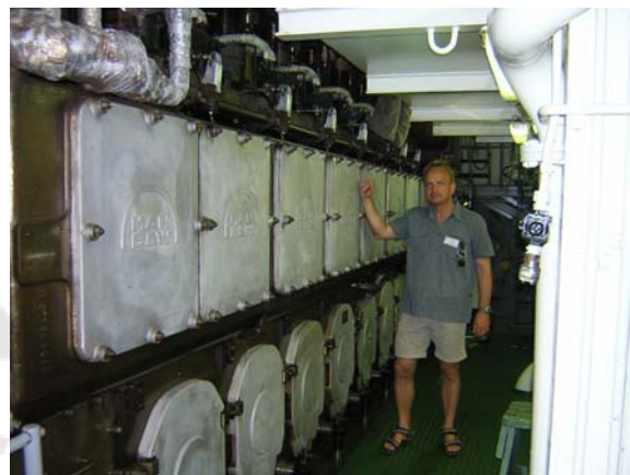
The MAN B&W 7-cylinder motor

Oy RVS Technology Ltd. from Helsinki, Finland produces active coating products for restoration and prevention of wear of combustion engines, gears separators and bearings. Furthermore the technology has the capacity to clean coked cylinder surfaces and coat them new.